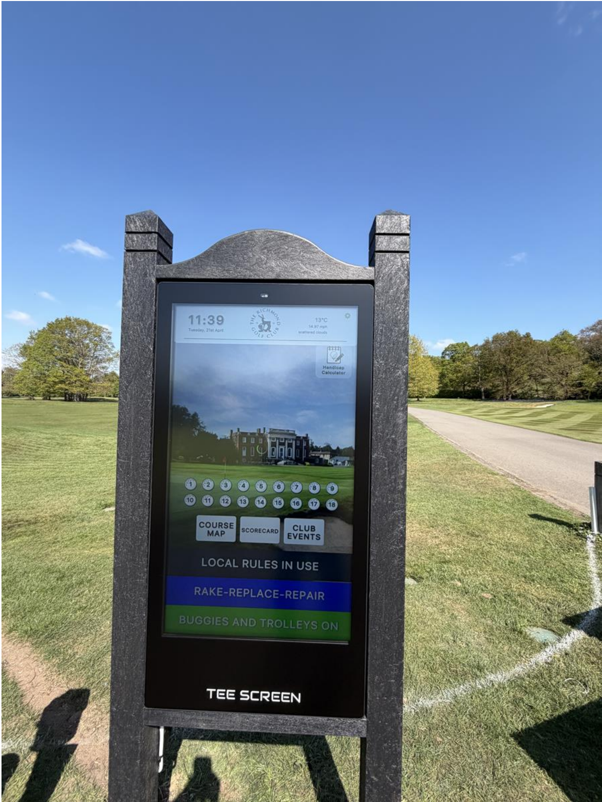
Internal Free Standing Tee Screen Installed for Changing Room Notices